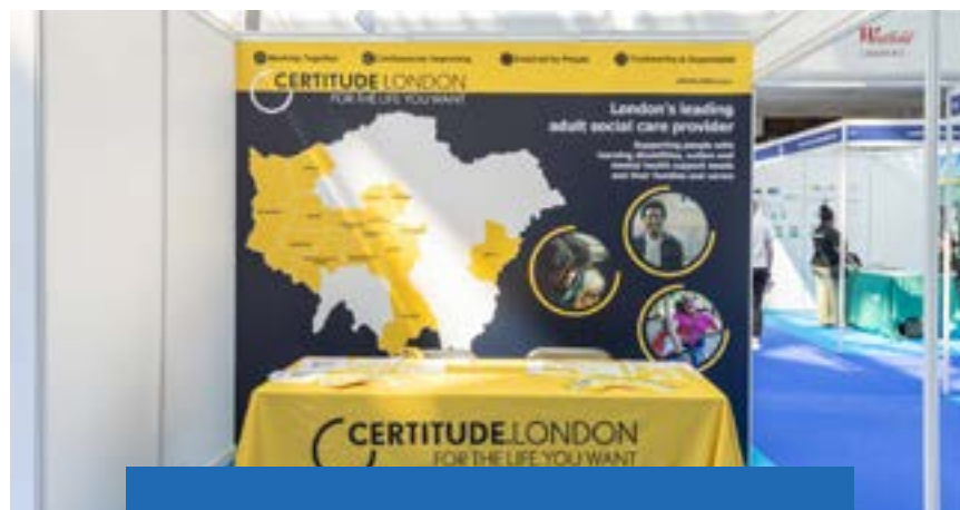
3m x 2m – £2,670 + VAT