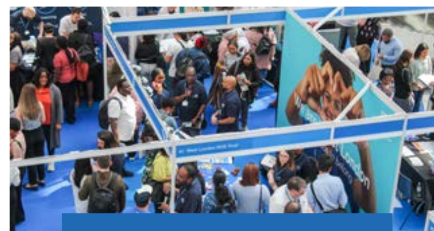
4m x 3m – £5,340 + VAT