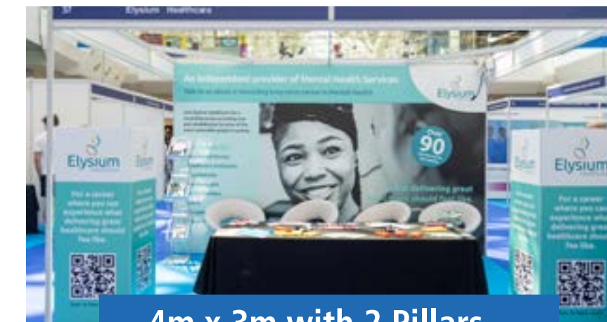
4m x 3m with 2 Pillars – £5,840 + VAT