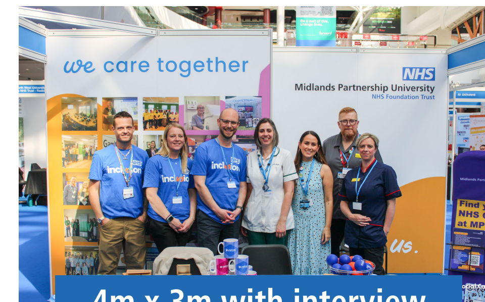
4m x 3m with interview booth