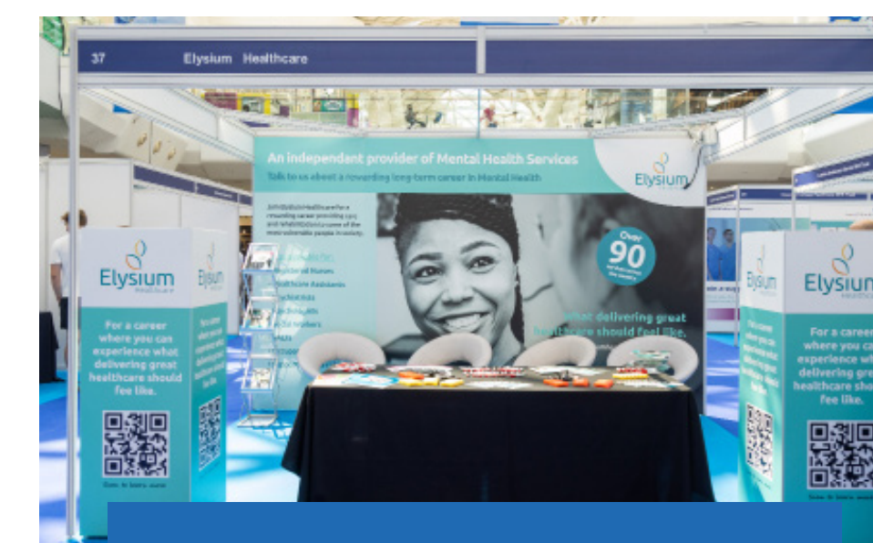
4m x 3m with 2 Pillars