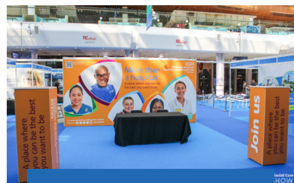
5m x 5m with 2 Pillars