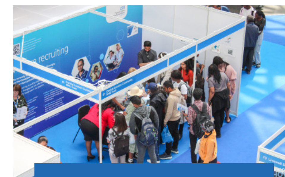
5m x 3m with 2 Pillars