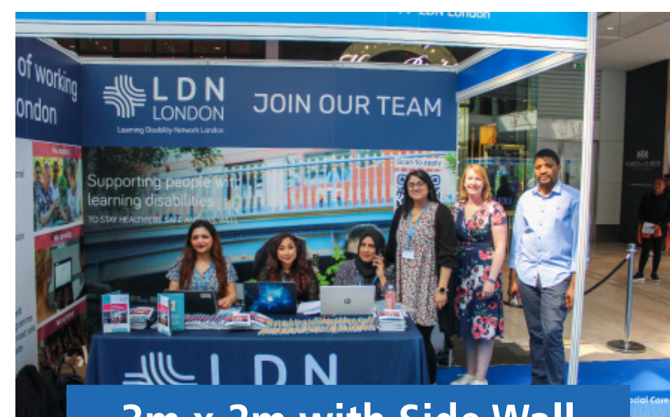
3m x 2m with Side Wall Graphic Panel