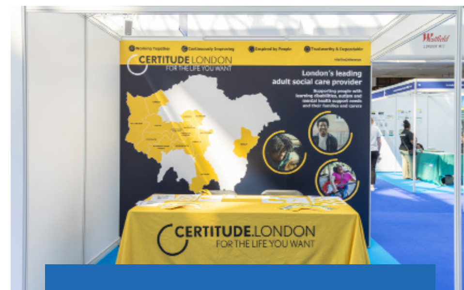
3m x 2m